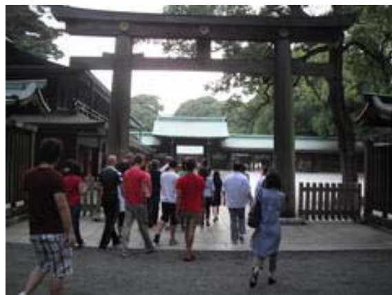
These pictures are from the 2011 Summer Session. One shows the Japanese drumming practice by Summer Session students and the other shows participants visiting Meiji Shrine.