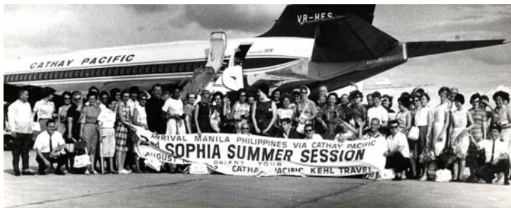
This is a picture of a post-session sightseeing trip to Manila.

Sophia University was one of the thirteen universities chosen in 2009 by the Ministry of Education and Science as part of the Global Thirty, the institutions that are expected to take the lead in educational globalization activities. Everyone expects that the role of the Summer Session program in educating students from overseas about Japan will be one key to such educational globalization.