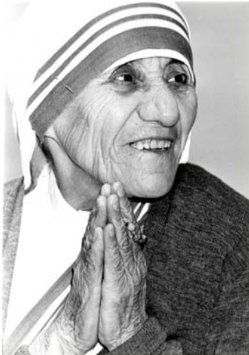
Mother Teresa (born 1919, died 1997)

In her lectures, Mother Teresa communicated the message that, even in a country like Japan that is rich materially, there are many persons who suffer from spiritual hunger.