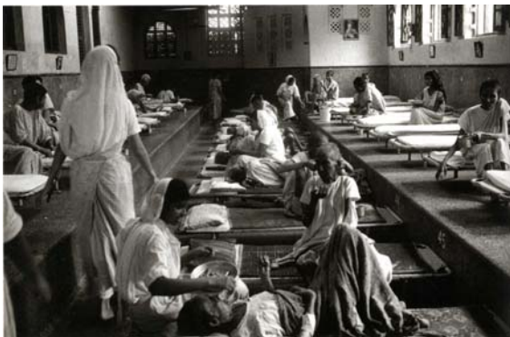
This picture shows the home for people waiting for death.

Her first work was to gather children who had been abandoned on the streets and give them free instruction on the street. Many of the students she had taught at St. Mary's felt great sympathy with this work, so Mother Teresa gathered them together. They came to be supported by donations of money and other gifts from churches and local supporters. She founded the Missionaries of Charity in 1950. The groups she founded